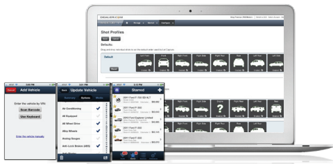
Mobile Lot Capture